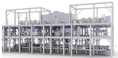
Caption 1: With the Phantom technology, wipes can be produced "plastic-free".

Pulp or cellulose fibers as raw material for manufacturing nonwovens are currently virtually unrivaled with regards to sustainability and environmental compatibility. The Oerlikon Nonwoven airlaid process is the ideal solution for processing this raw material into high-end products for a wide range of applications. Today, there is huge demand for manufacturing solutions for high-quality, lightweight airlaid nonwovens with economically-attractive production speeds and system throughputs. Here, the patented Oerlikon Nonwoven formation process, which has proven itself in numerous production systems, is setting standards – for homogeneous fiber laying and superb evenness even for nonwovens with low running meter weights. Whether as a system exclusively for airlaid nonwovens or combined with other nonwoven processes, the benefits of the Oerlikon Nonwoven airlaid technology are today already being deployed in numerous applications.